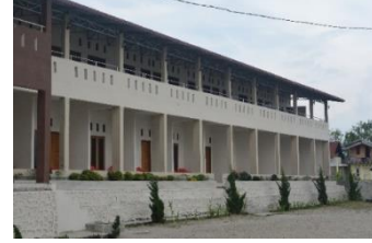
Figure 6. Hotel in Situngkir alongside the beach