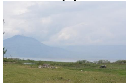
Figure 3. The abandoned land

The locals are not satisfied (Table 3, 2) and felt not facilitated by the government. However, according to the interviews with an academic, both the locals and government have been doing their best to prepare Situngkir. The problem is the lack of promotions or involvement of third parties. Also, this village