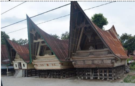
Figure 2. Rows of traditional houses

According to both locals and tourists (Table 3, 1), Situngkir village has implemented a development based on the local culture with the existence of rows of traditional Batakese houses (Figure 2). However, the row of traditional houses as observed, are still not well-maintained and not neatly arranged and looks dirty thus reducing the interest of tourists to explore further. The typical traditional houses need to be preserved regarding their patterns and custom settlements with the traditional aspects which is hereditary so that it does not reduce the authenticity of local cultural values [18].