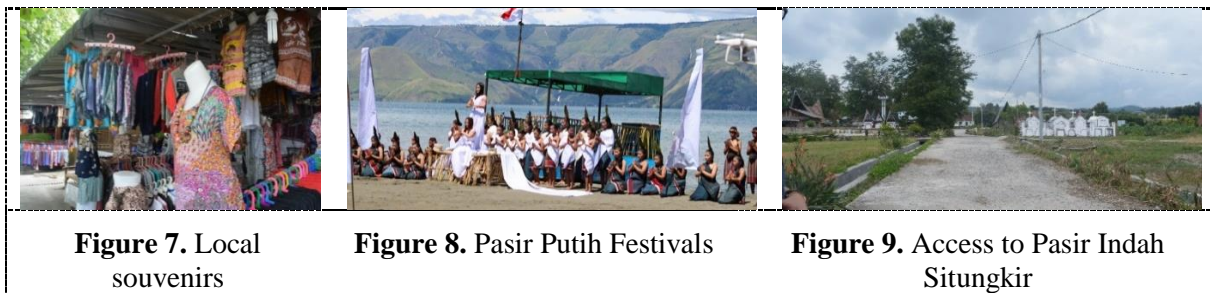
Figure 7. Local souvenirs